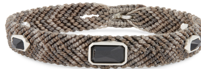
The Protector 15mm - silver - safari blend