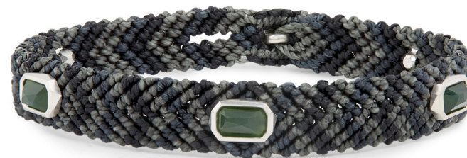
The prodigy 10mm - silver - jungle nights blend