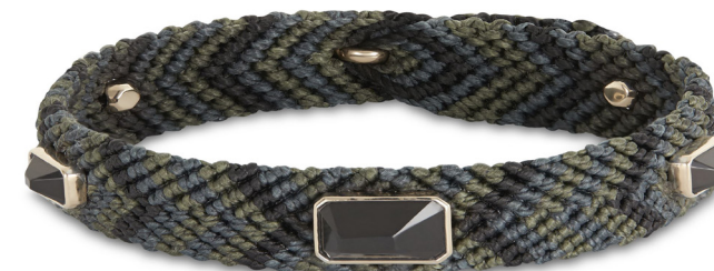
The Protector 15mm - platinum black